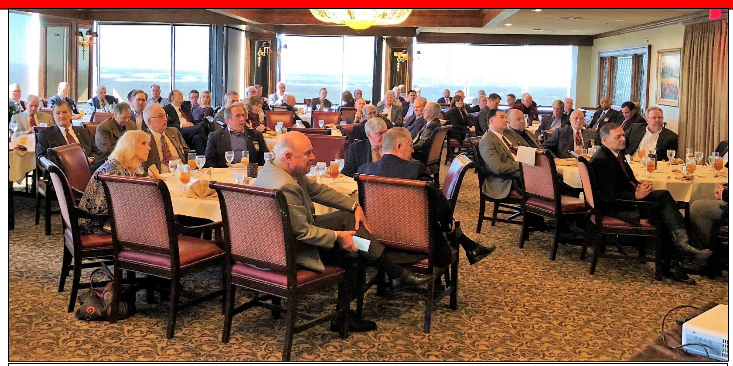
Great location, buffet to die for, Speakers that educate and motivate, Companionship, and camaraderie. These are a just few of the factors that contribute to the continuing growth and involvement of the Dallas Chapter. The March Luncheon was another Full House.