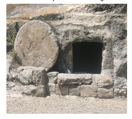
The Lord is my Shepherd. 23<sup>rd</sup> Psalm

Asked to recite the twenty-third Psalm, a Sunday school child began, "The Lord is my shepherd; that's all I want!"