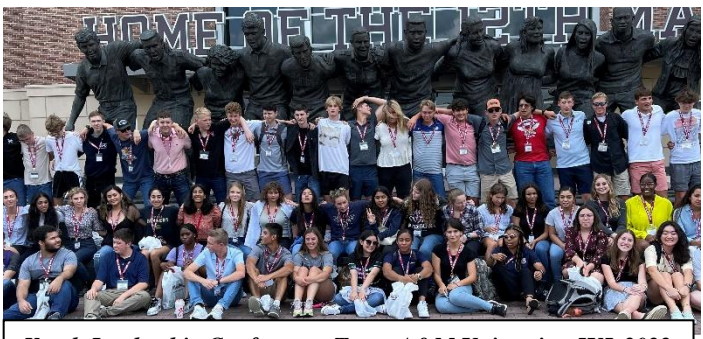
Youth Leadership Conference, Texas A&M University, JUL 2022

Several new Companions have stepped up to serve, but we need more volunteers to help in supporting the ROTC, JROTC, YLC, and CAP programs.