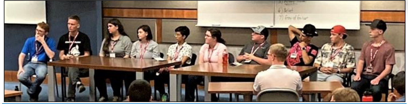
During the Youth Leadership Conference at Texas A&M University each "Team" had the opportunity to hear an actual case that was presented before the US Supreme Court and then vote on how they would have ruled had they been the Supreme Court Justices. I am happy to report that they voted identically to the Justices in 8 of the 10 cases covering the first Ten Amendments to the US Constitution.