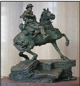
In Honor of the Horse Soldiers

Invitations have been sent to "all the usual suspects" to include: the Governor of Texas, Mayor of Dallas, Local, State and Federal officials, and a necessarily smaller number of guests.