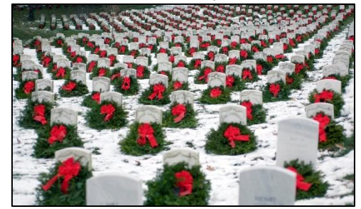
Tens of thousands of wreaths will be laid in cemeteries throughout the nation.

If you wish to lay a wreath, plan to arrive as early as 9:00 a.m.