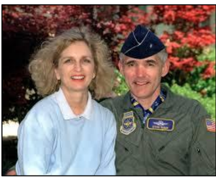
Best Wing Commander couple in the US Air Force

It was a classic example of what he calls the "non-lethal" use of the US Air Force to influence crisis events.