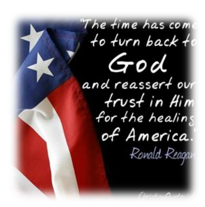
"Turn to God for direction"

Our televisions, phones, and radios remind us daily that we live in a world filled with turbulence. uncertainty, conflict, and anxiety.