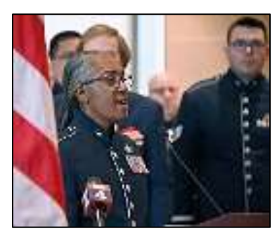
The event opened with a stirring rendition of the National Anthem sung by a member of the Texas Air National Guard.