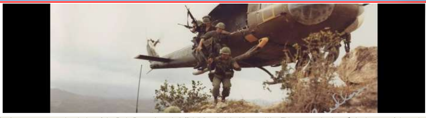
On January 27, 1973, the signing of the Paris Peace Accords "officially" ended the Vietnam War. This year marks the 50th Anniversary of the end of American participation in the war. On March 21, 2023, a coalition of North Texas veterans' organizations will conduct a Commemorative Event in the Frontiers of Flight Museum (6911 Lemmon Avenue) to honor all those who served during the War ,including their families. The event is free and open to the public. Refreshments will be served. See the flyer on page 1 for details. .Plan to arrive early. This promises to be a Standing Room Only gathering.