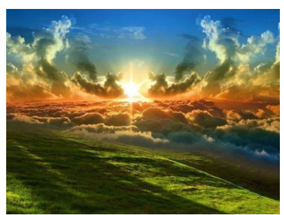
Living One Day at a Time

Did you know that there are at least two days in every week about which we should never worry?