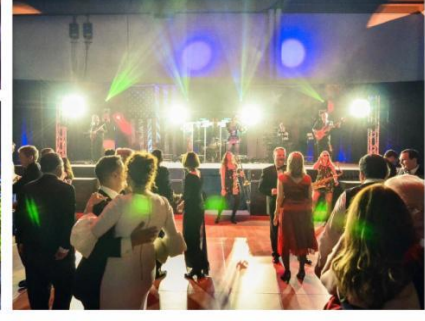
The Dallas Military Gala/Ball will begin at 1700 hrs, in the Sheraton Dallas Hotel. Come early, stay late, find a steal at the Silent Auction prior to Supper. Mess Dress uniforms and evening gowns are preferred but not obligatory