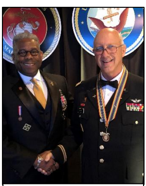
Former Congressman and Dallas Perpetual Companion LTC Allen West pledged to continue to serve when called upon