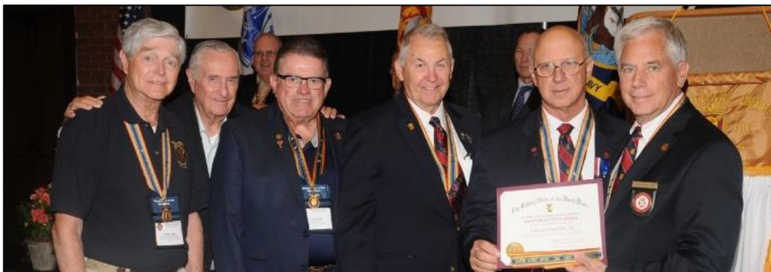
Pictured above are a few of the Dallas Chapter Officers who were on hand to receive the Best Large Chapter Award during the Annual National MOWW Convention in Columbus, GA.