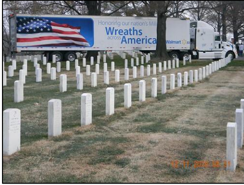
40,000 wreaths were laid, by hundreds of volunteers, one for every headstone

you answered the call to serve beyond your duty and rose to the occasion. WELL DONE! In the big picture because of many donors, for the first time in the Dallas - Fort Worth National Cemetery