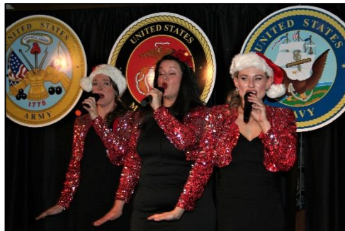
Ladies Liberty knocked it out of the park with songs, dance, and all that jazz.

For those of you who did not come to the Chapter Christmas Gala, talk to those who were in attendance. You really missed an event to remember. As expected, the Park City Club delivered an outstanding dinner. Those in attendance really enjoyed the Social Hour and Silent Auction. The sur-