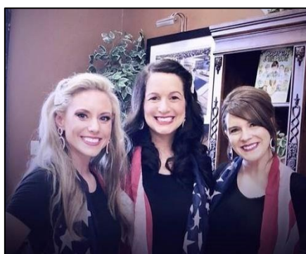
The "Liberty Ladies" dazzled us with songs and dance routines that set the tone for a very, very Merry Christmas evening.