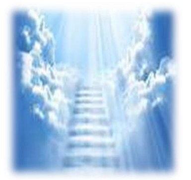
Button Your Pocket

Several years ago, a serviceman wrote a bit of unintended comedy he witnessed while in the army. It happened during the company's morning inspection.