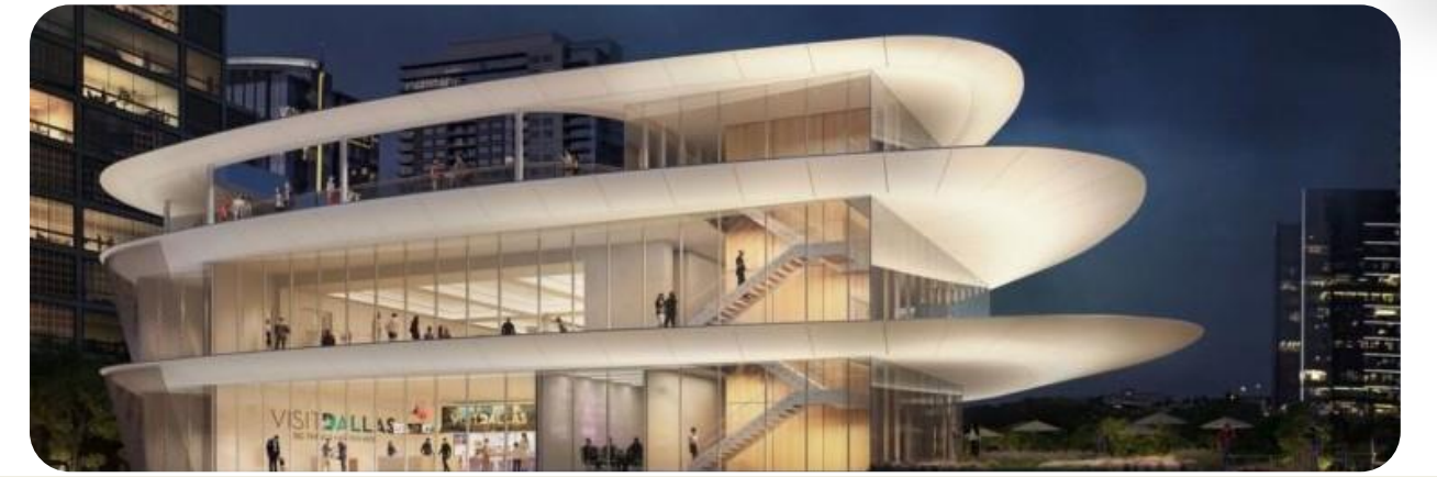
One of the major design proposals for the expansion of Klyde Warren Park over Woodall Rogers Freeway in the heart of Downtown Dallas