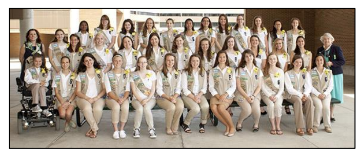
2017 Girl Scout Gold recipients of GS Northeast Texas Council

The Dallas Chapter will once again present Certificates to as many as 250 Gold Girl Scouts during the annual Awards Day Breakfast for GS Northeast Texas Council, in April . The GSNETX Council supervises the largest collection of GS Troops in the nation.