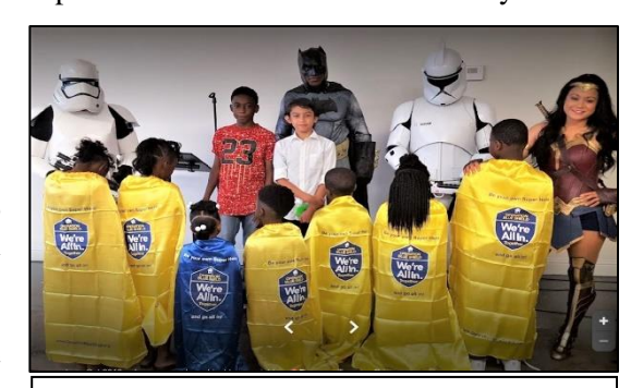
"Kids, Cops, and Heroes", one of many popular One Community USA programs that unite rather than divide.

This group goes directly to neighthe borhoods. and works to build and strengthen relationships between the community, local business owners and 1aw