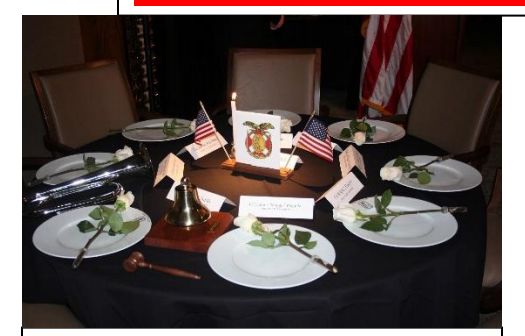
The evening began with a moving tribute to our Fallen Companions, who passed away in the last year