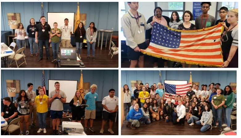
YLC Students presented a tribute to four "famous flags"

Students attending the Youth Leadership Conference at the University of Texas in Dallas used four historic flags to tell a story of Patriotism, Service, and Sacrifice.