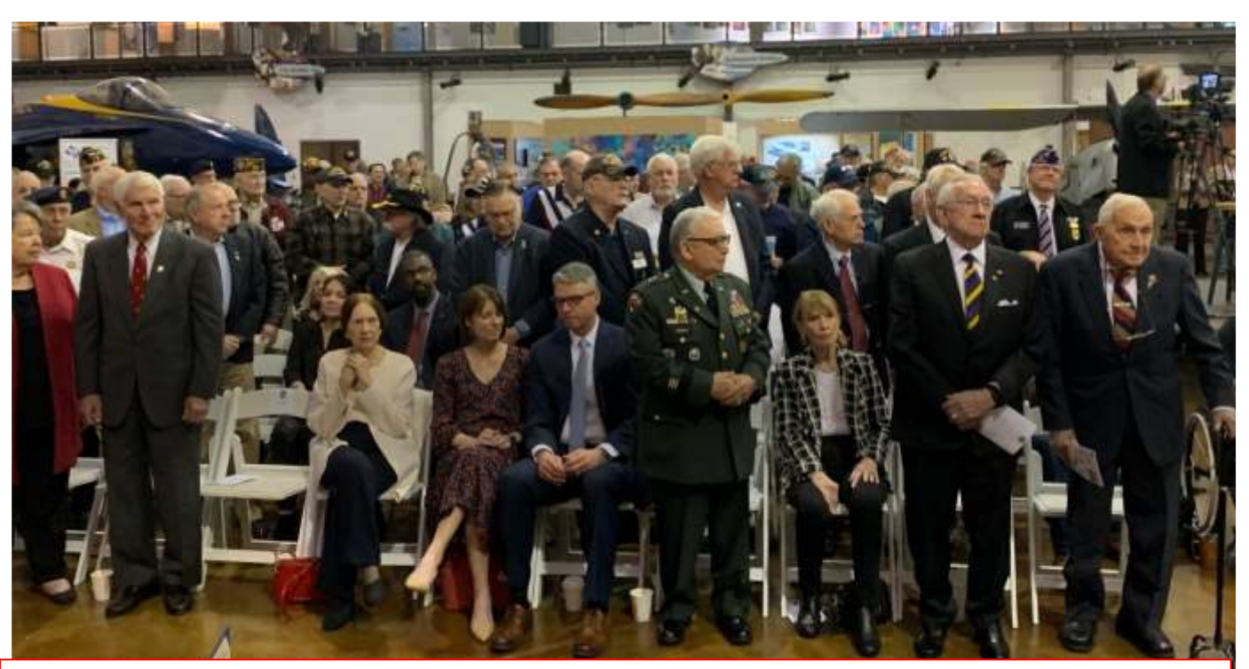
Prior to the conclusion of the ceremonies, the Emcee asked that all those who had served in the War rise to be recognized. The warm and prolonged ovation that followed was a reminder that younger generations realize the sacrifices and courage of those who served were not in vain and have not been forgotten.