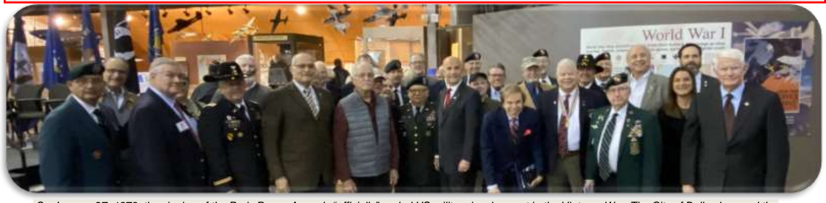
On January 27, 1973, the signing of the Paris Peace Accords "officially" ended US military involvement in the Vietnam War. The City of Dallas honored the Veterans of that war with a ceremony commemorating the 50th Anniversary of the Paris Accords. On March 21, 2023, a coalition of 24 North Texas veterans' organizations met in the Frontiers of Flight Museum to salute all those who served during the War and to pay special tribute to those who paid the ultimate sacrifice. See the photos on pages 6&7 for details. The thirty veterans above are all members of the Dallas Chapter of the Military Order of World Wars.