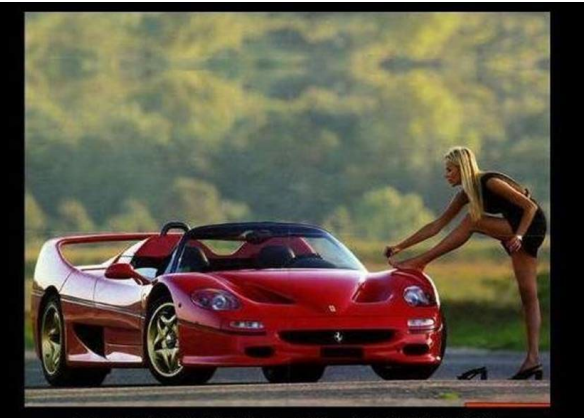
FINANCIAL PLANNING LONG TERM: THE CAR IS CHEAPER