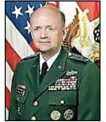
GEN Gordon Sullivan, US Army (Retired)