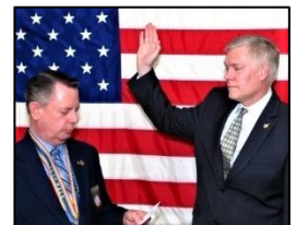
Hon. Pete Sessions

In July, we will hear from the Hon. Pete Sessions , former US Congressman from Texas (for 22 years). He will discuss the current state of dysfunction in Washington. We are proud to be able to say that Pete has been a Perpetual Companion of the Dallas Chapter for more than a decade.