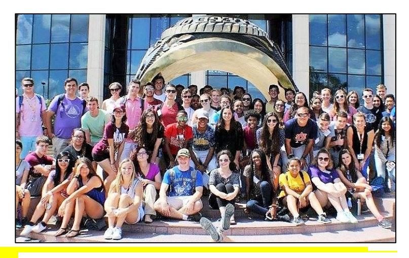
COMPANIONS – The Dallas Chapter has been recognized as the Best Large MOWW Chapter in the Nation for more than a decade.

Uppermost among the reasons for that richly deserved recognition is our support of YOUTH Programs.